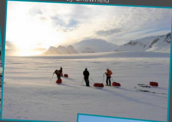
Early rise at Murray Snowfield