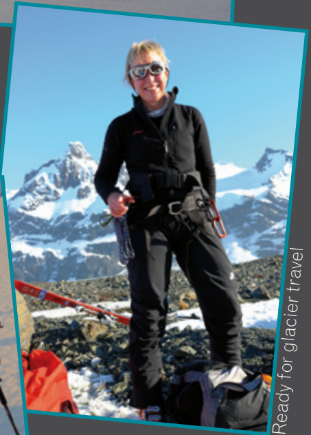
Ready for glacier travel