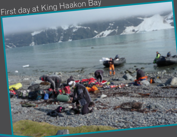
First day at King Haakon Bay