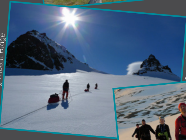
Approaching Trident Ridge