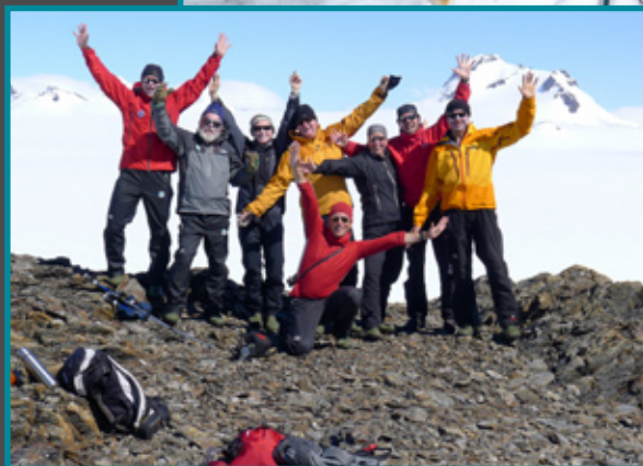
The expedition team 2010